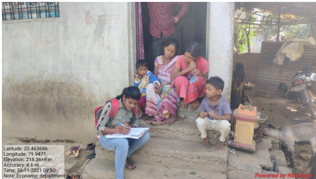
Economic Survey (30/11/21); Conducted by Department of Economics