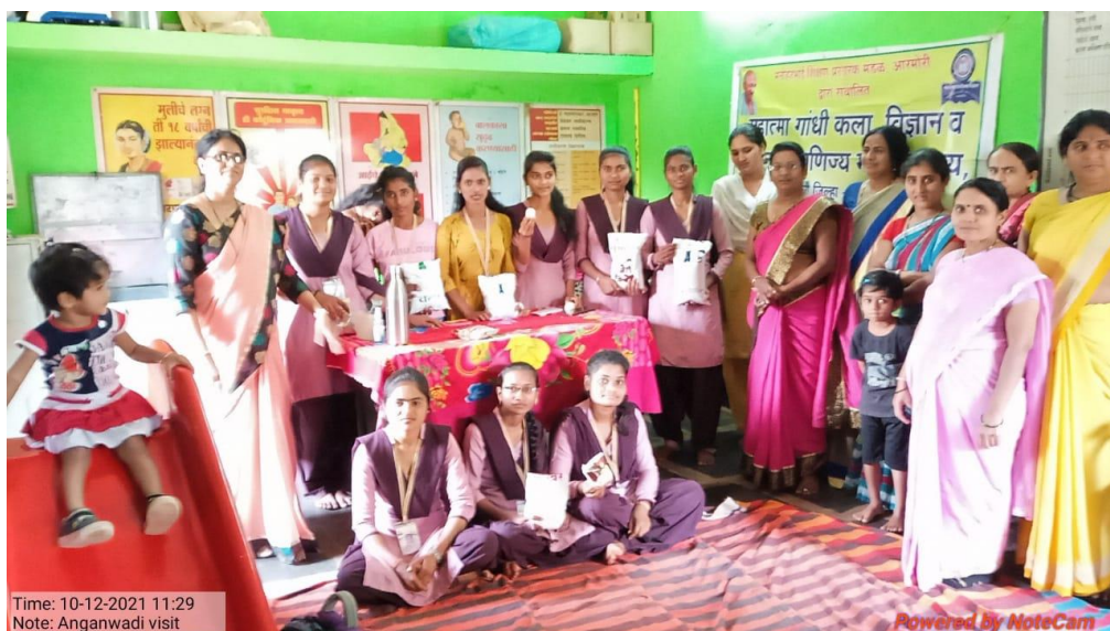
Child Care Centre's Visit (10/12/21); Conducted by Department of Home Economics