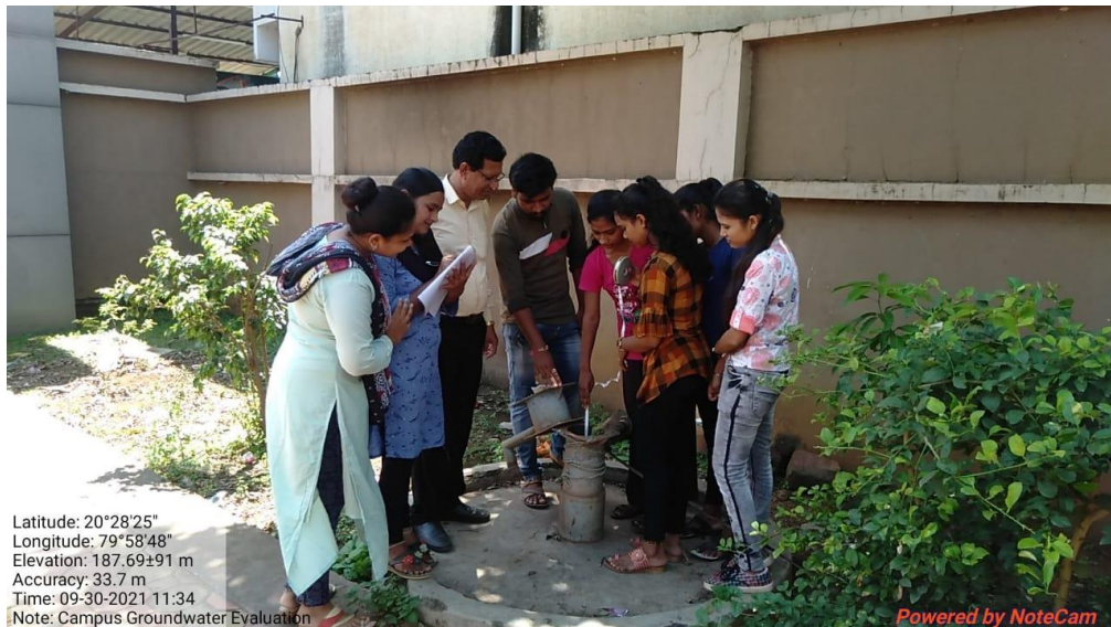
Campus GW Survey (30/09/21); Conducted by Department of Geology